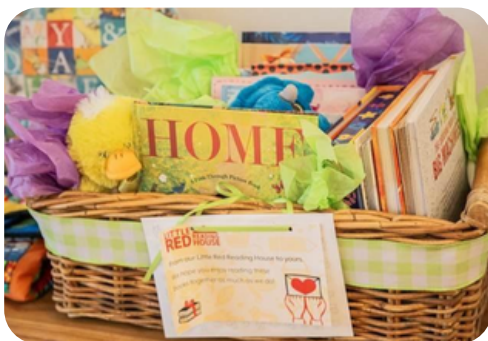
Welcome basket provided by the Book Bank

The Little Red Reading House Book Bank has partnered with the Calgary Food Bank since 2015. Through this collaboration, the Book Bank supplies up to 500 books each month to stock the Food Bank's Birthday Room, a special space where children and youth can choose a book to celebrate their birthday.