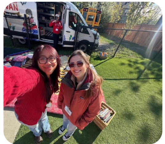
Werklund School of Education students supporting a Little Red Reading Van visit in the community

The Little Red Reading House continues to engage students from UCalgary's Werklund School of Education through experiential learning opportunities where aspiring educators gain hands-on experience working with children and families. The students serve as House hosts and support Little Red Reading Van visits, engaging children with stories and books to foster literacy skills and a love of reading. These educators-in-the-making are gaining insights to bring into their future classrooms where they can create environments that nurture literacy.