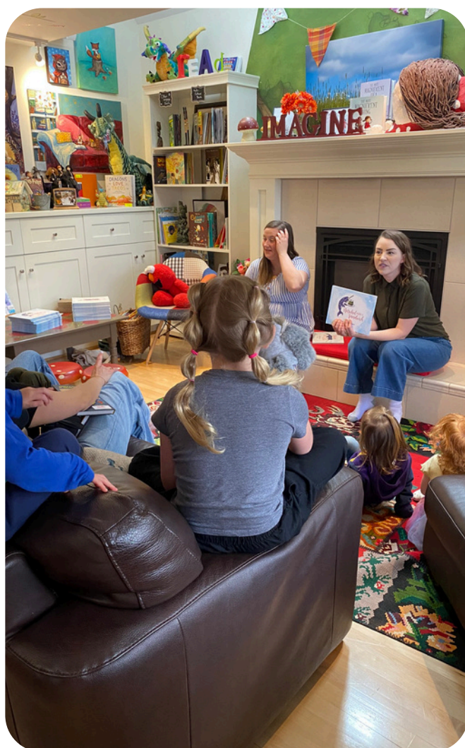
Story-book Series with local authors

We also hosted special events to offer extra delight for visitors.