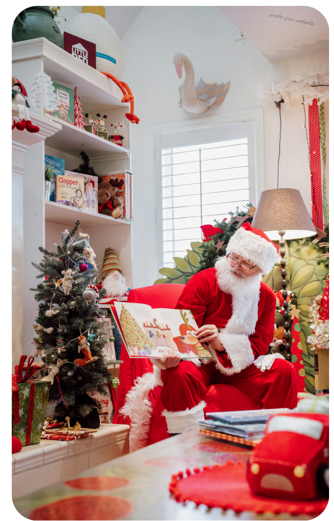
Story-time with Santa